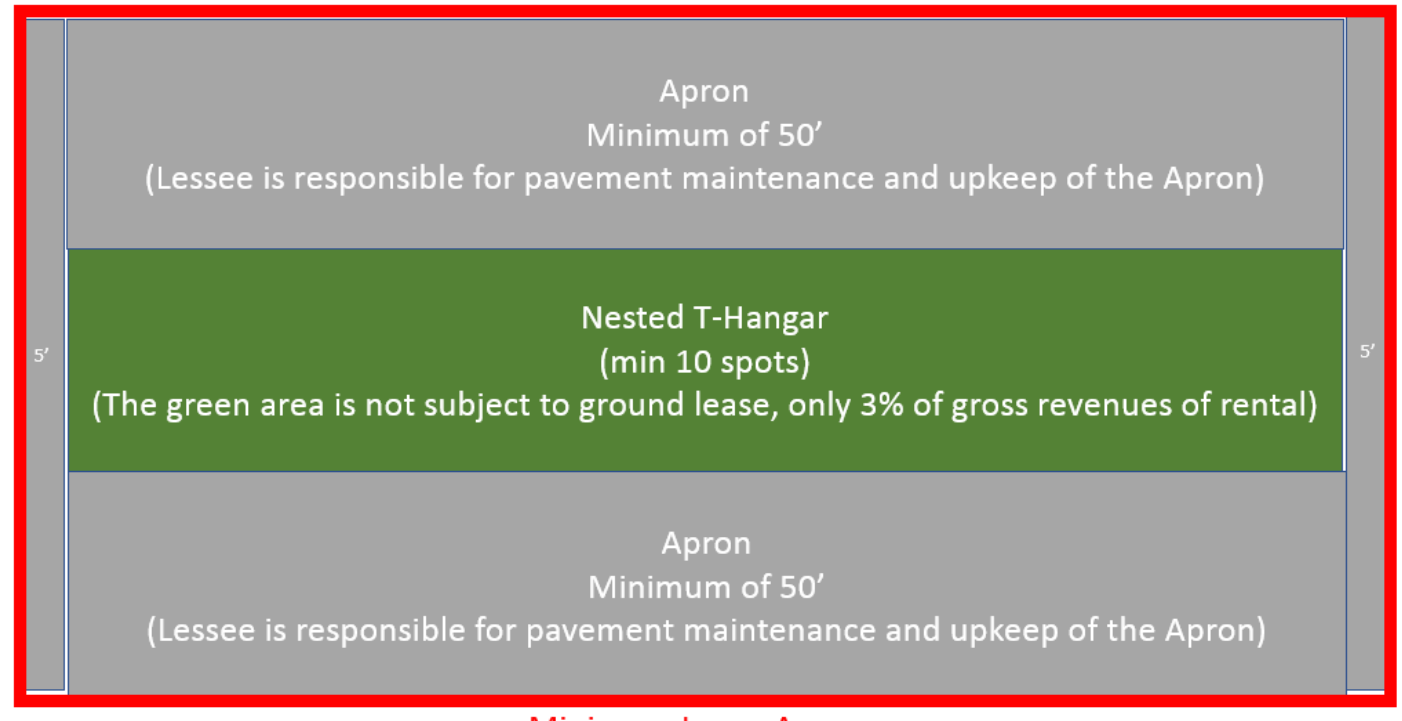
Minimum Lease Area