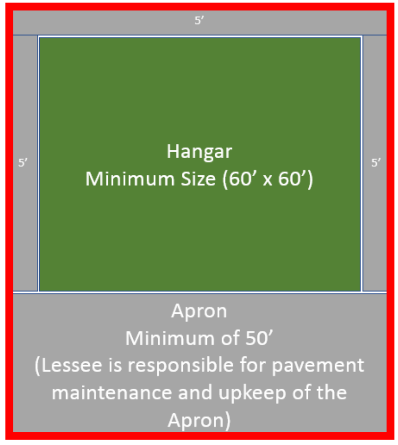
Minimum Lease Area