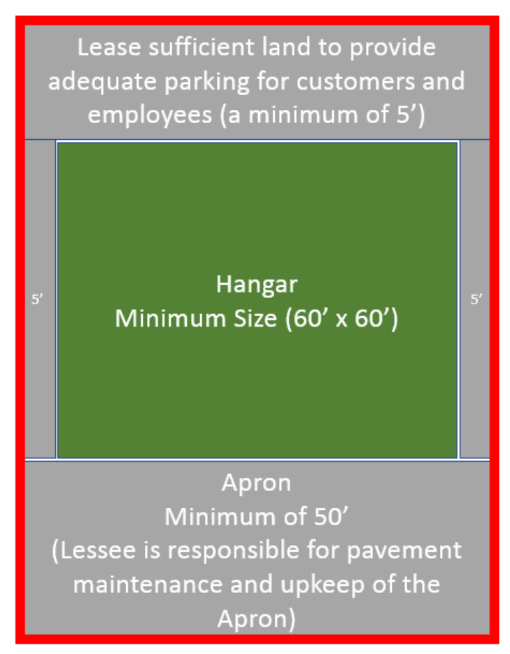
Minimum Lease Area